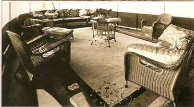
Freedom is McMillen Yachts' current project. The 1926 104-footer is the sister ship to Sequoia , the former presidential yacht.

McMillen Yachts, 401.846.5557, www.woodenyachts.com